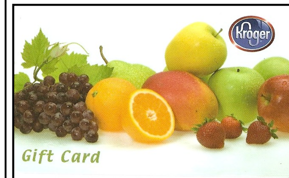
Sample Gift Card

Cathy Taylor 2324 Woodcreek Place Powell, Ohio 43065